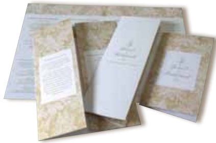
A photograph of the St. James's wallpaper at Fortnum & Mason helped to brand the menus

If this inspires you to build on, or start using, photography as part of your brand platform - don't hesitate to get in touch with us.