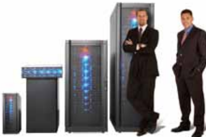
Portraits to profile key people