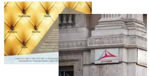
Affordable stock images can be manipulated to create something unique